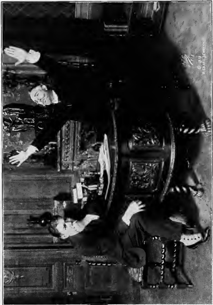
DOCTOR'S GRIEF AT THE IGNORANCE OF THE PUBLIC